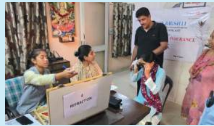
Rotary Club of Delhi West organised a Mega Eye Camp with free Cataract Surgeries in association with Shroff Charitable Eye Hospital. More than 200 people are expected to benefit from the facilities.