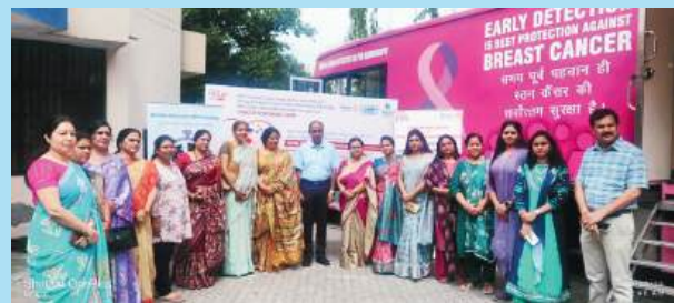
Rotary Club of Delhi West in association with Apollo Hospitals organised a Mega Health Camp with Mammography at NTPC, Dadri