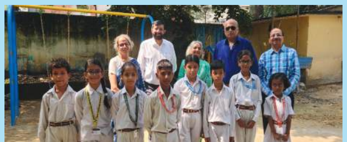
A visit to Swami Sivanand Memorial Institute, School and Skill Centre for a long term association.