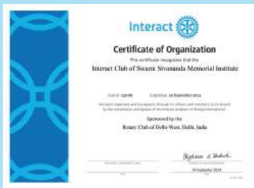
Chartered Interact Club of Sivananda Memorial Institute