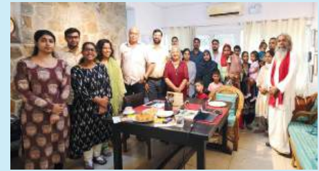
Rotary Club of Delhi West visited Cure India, the biggest Network in India for treating Clubfoot, with more than One lac Treatments. we distributed Braces to the treating Children and explored possibilities for further association.