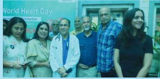
On the occasion of ensuing World Heart Day, Rotary Club of Delhi West In association with Citizens Forum, Interact Club and Fortis Hospital organised a Talk on Cardiology and Heart Health at Fortis Hospital, Vasant Kunj.