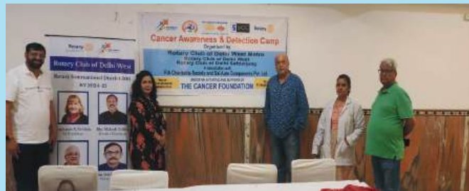
Rotary Club of Delhi West organised a Mega Cancer Awareness and Detection Camp with Mammography at Gurudwara, Naraina