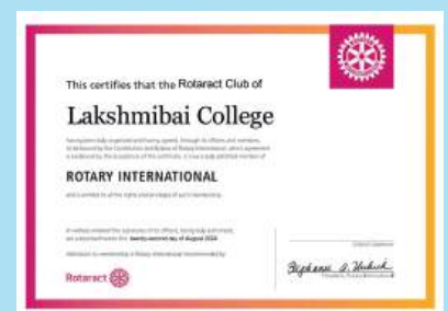
Chartered Rotaract Club of Lakshmbai College