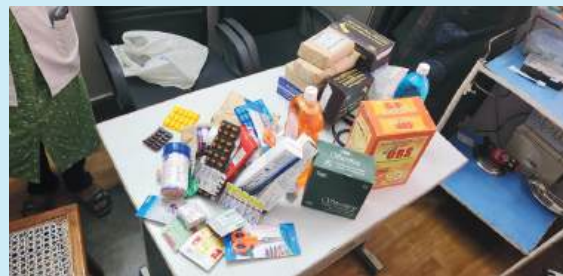
Rotary Club of Delhi West gifted Medicines to Medical Room, Maitreyi College, Delhi University for the benefit of Students.