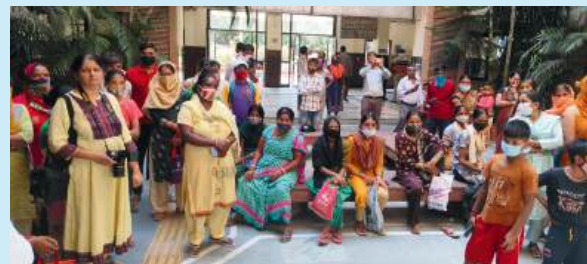
Food Baskets distributed to TB Patients at NITRD under Nikshaya Mitra Scheme. RID 3011 Clubs including RCDW plays a significant role in this community service.